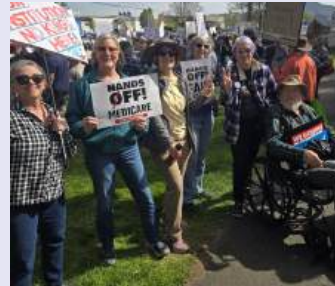
Members participated in the June 14th March in Medford.