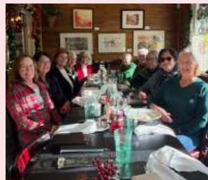
Lunch Bunch at the Bella Union

What flower gives the most kisses on Valentine's Day?