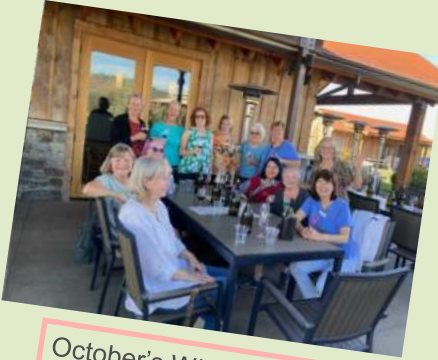
October's Wine & Whine at Kriselle Winery (see pg. 8 for schedule info.).