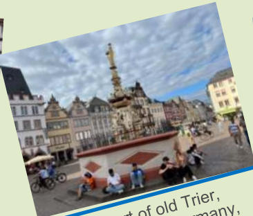
Monica Weyhe in Europe!