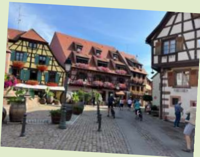
Our place in Ribeauville, Alsace, France.