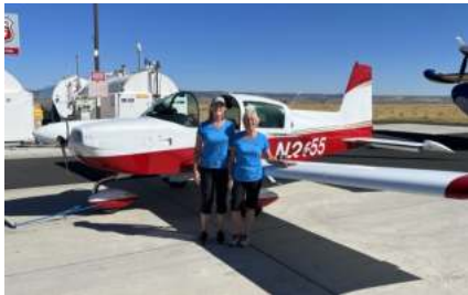
Team "Cheetah Champs" halfway through the Derby after refueling in Burns, OR.