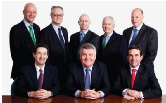
TYPICAL U.S. BOARD OF DIRECTORS

The #1 priority for Public Policy this legislative session for AAUW is House Bill (HB) 3110 , which would require Boards of Directors of publicly traded corporation to have a specified proportion of female directors and directors who are members of under-represented communities. Violations of this mandate would incur a civil penalty (fine) of at least $100,000. Once passed, this bill would take effect on the 91st day following adjournment. AAUW strongly supports this Bill's passage, because we believe that diversity on corporate boards is not only fair, it's good for business!