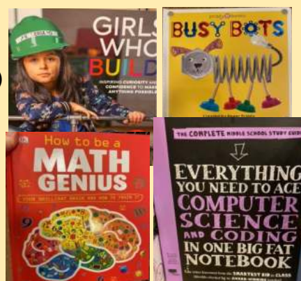
SOME OTHER CHOICES

Girls Garage: How to Use Any Tool by Emily Pilloton ($29.99)