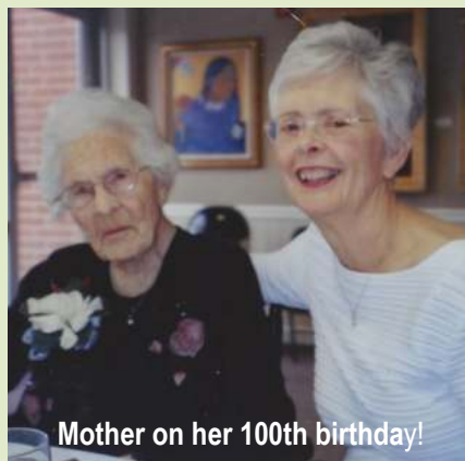
Mother on her 100th birthday!

When I was graduating from high school, my Mother said to me, "It is not what you have, but what you do that counts." It was very meaningful. I think it came about because one of my friends was getting her own car as a graduation gift; my gift was a new suitcase for my journey to college.