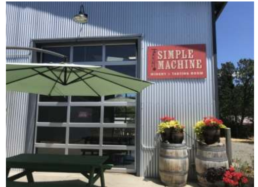
BEFORE (Tasting Room)

Although they are truly devastated by their loss, Brian and Clea say they will rebuild. One way to help them is by joining the Simple Machine AF (“After Fire”) Wine Club . When you join, you are pre-purchasing future wines, including white wines and the winery’s first-ever rose, all available in 2021. Full details are available on their website: simplemachinewine.com .