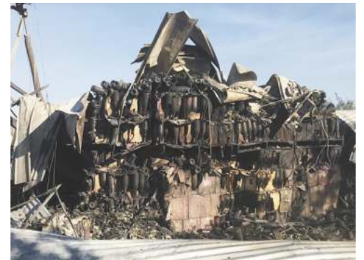
AFTER (Wine Storage)