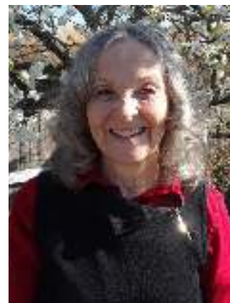
NEW BRANCH MEMBER

I was born in Binghamton, New York. My parents (for job opportunities) moved the family to Rochester when I was six. During high school I loved all things out-of-doors, and kept a journal of poetry and travel experiences. My journalism teacher asked me to edit the high school literary magazine. I wrote stories for local travel magazines, and loved languages and travel.