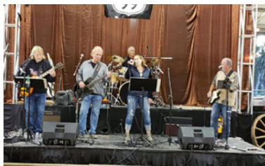
The band was super!