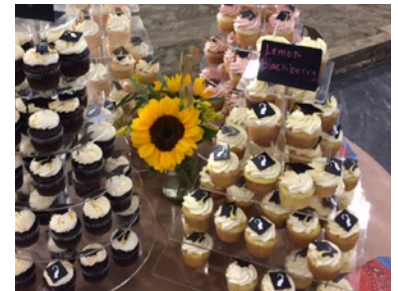
Yummy cupcakes from Sweet Sensations... Pretty AND delicious!