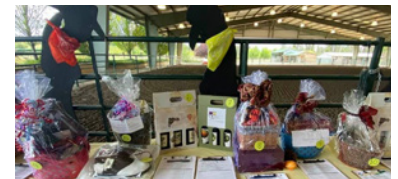
A few of the silent auction items that were snapped up by savvy bidders