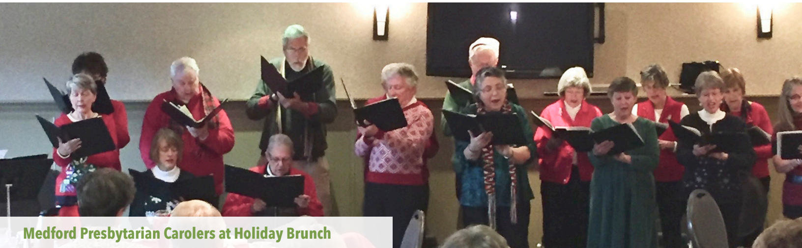
Medford Presbyterian Carolers at Holiday Brunch