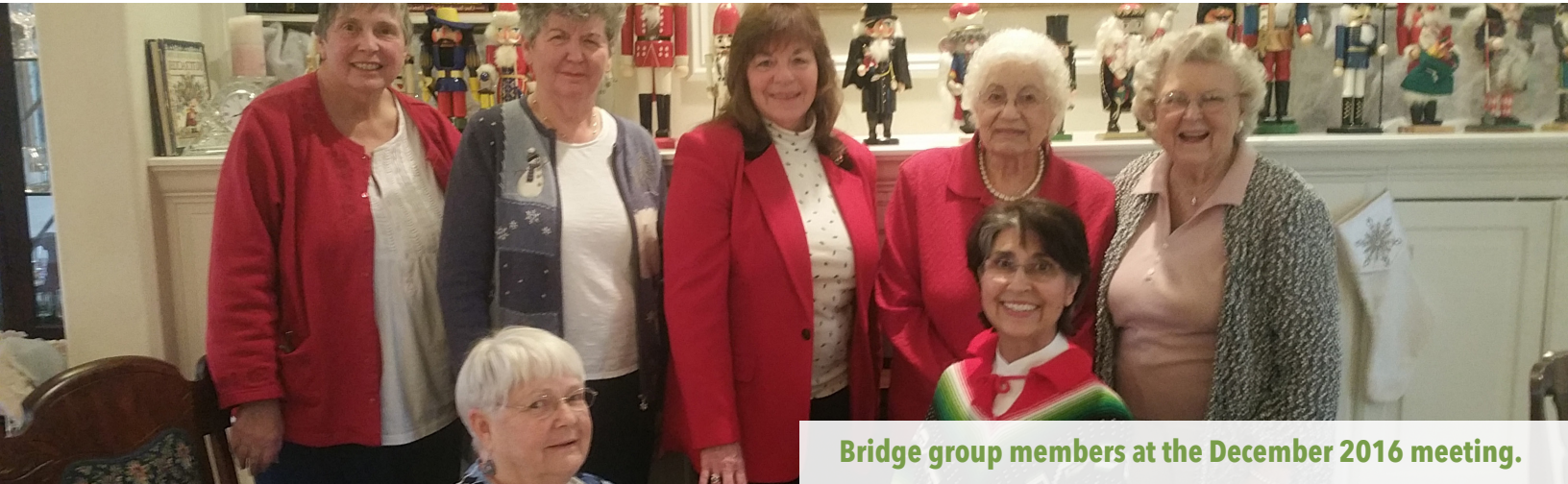
Bridge group members at the December 2016 meeting.