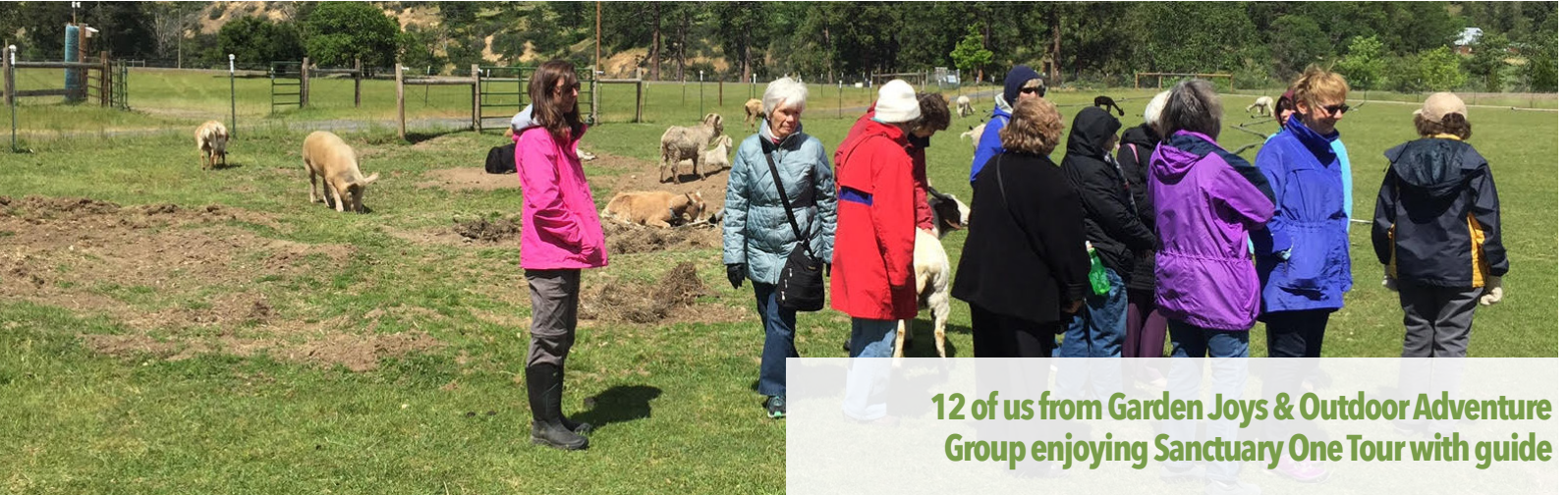
12 of us from Garden Joys & Outdoor Adventure Group enjoying Sanctuary One Tour with guide